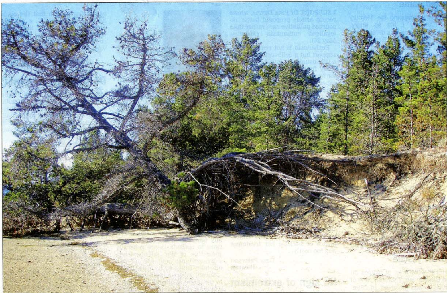
FORCE OF NATURE: Slowly rising ocean levels have combined with tidal and wave impacts to cause this erosion at Pitt Water near Seven Mile Beach.

People who spend time around our coasts, notably those who own land washed by sea, are already noticing subtle changes to the most vulnerable parts of our coasts, and governments at all levels are starting to take notice.